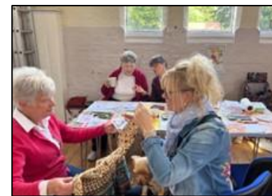
Make Do & Mend Volunteer passing on sewing skills

Participants have expressed their enjoyment and fulfilment through their experiences in the program. Testimonials such as, "I loved having a go on the sewing machine and I had a great time! Look, I made myself a bag!" highlight the joy and confidence gained from learning new skills.