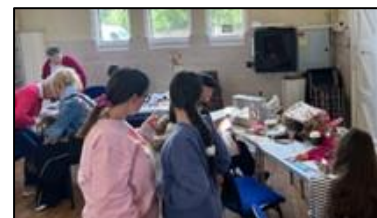
A true community event attended by all ages thanks to Hinckley & Bosworth VCS funding

In conclusion, "Make Do and Mend" represents not only a step toward sustainability but also a meaningful effort to foster connections within the community, encouraging a culture of learning, sharing, and repairing for the future.